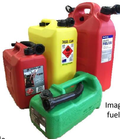
Image of typical fuel containers